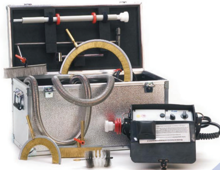
A selection of the wide range of accessories