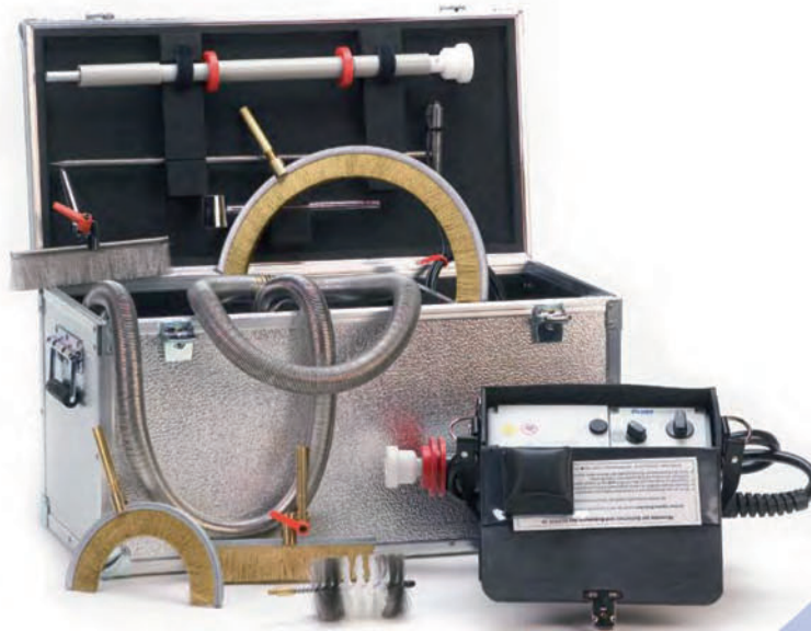
A selection of the wide range of accessories