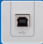
Data exchange via USB interface

By means of extremely short flash impulses the HELIO-STROB master allows the observation of very rapid processes with the naked eye. It provides pin sharp images of the apparently stationary object: the "stroboscopic effect". All functional adjustments can comfortably be set via the touch panel and the twist knob. When analysing fast processes such as rotation or vibration the standard features "slow motion" and "position" (phase shifting) put even the smallest detail into perspective. The finely graduated dimmer function allows an adjustment of the light intensity and thus enables fatigue-free observation to the smallest detail. The flash frequency can either be controlled by the accurate internal trigger, by an external trigger or even by mains synchronous triggering. Thanks to the integrated prescaler external impulses are processed up to a frequency of 8000 Hz*.